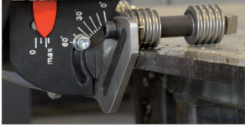
Continuous angle adjustment from 0 to 60°.